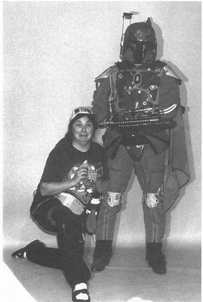
Volunteer... or else!

Please contact our ADA Liaison with your ADA needs and questions via the P.O. box, through the Norwescon website at www.norwescon.org , or ada@norwescon.org .